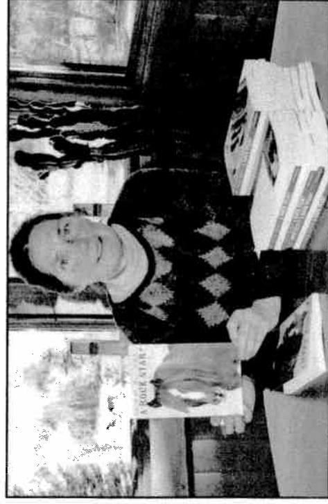
Hockley has written a book about various horse personalities. She believes that profiling a horse can determine how to best handle it, and in what kind of work it would excel.

Determining a horse's personality may allow it to be matched with an appropriate rider and training style.